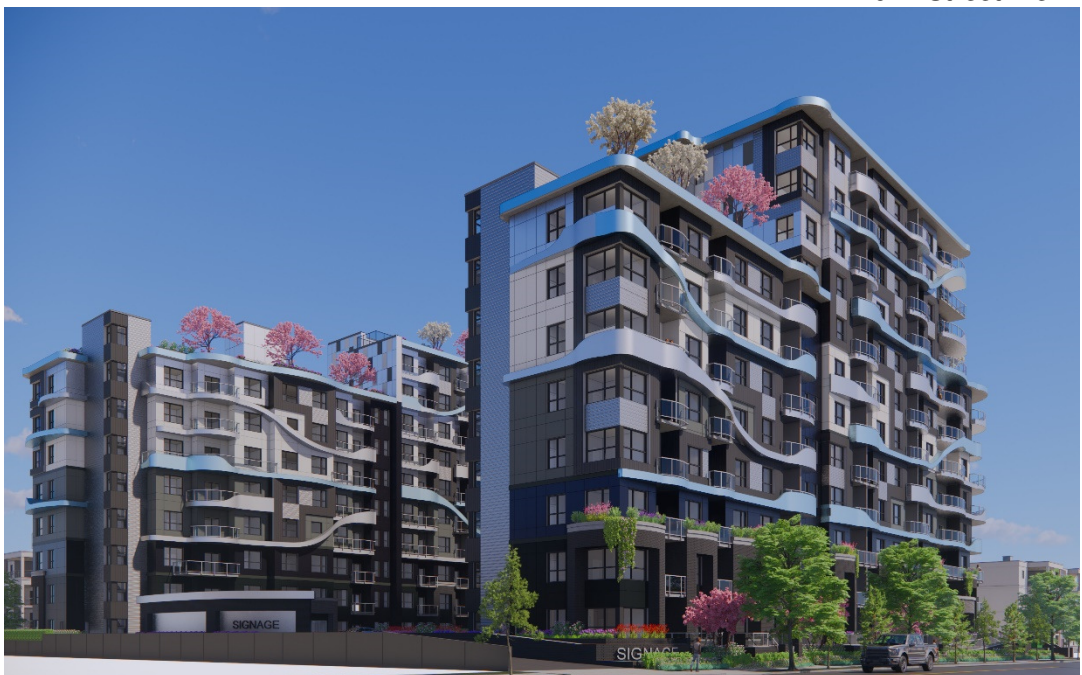
204 th Street View

If approved by Council, Whitetail Homes Ltd. is proposing to build an apartment building with an 8 storey 53 rental unit component and a 12 storey 327 strata unit component with 2 levels of underground parking.